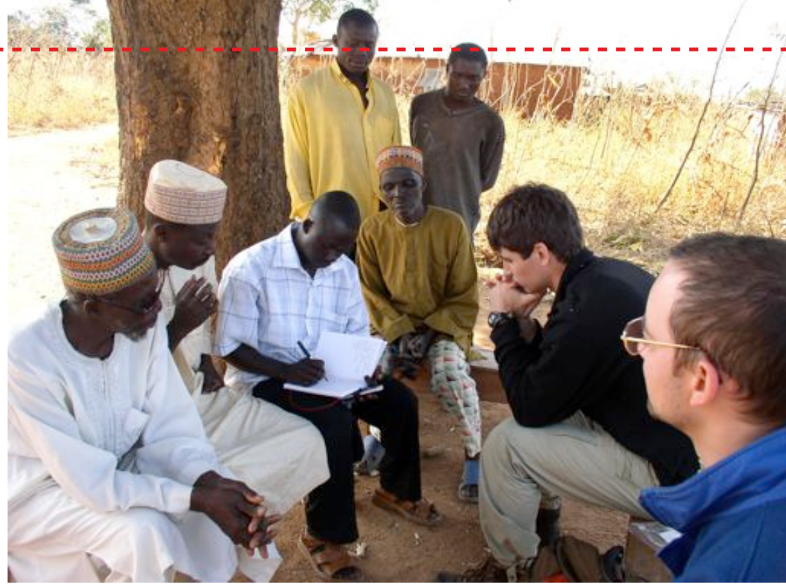
^ Meeting with chief, pastor and head of school in Shonong.